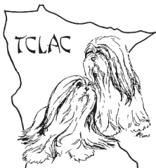
TWIN CITIES LHASA APSO CLUB