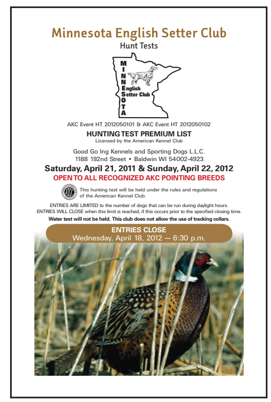
premium list available at www.minnesotaenglishsetterclub.com

From Interstate 94, take exit 16 for Cty. Rd. T at Hammond - Go north on Cty. Rd. T, 3.4 miles through the town of Hammond. Stay to the right (just past Hammond Golf Course) to stay on Cty. Rd. T, 2.1 miles. Turn right on 110th Ave. 1.0 miles. Turn left to stay on 110th Ave, .2 miles, Turn left on 192nd. St. 0.8 miles. Hunt test will be at the end of the dead end road.